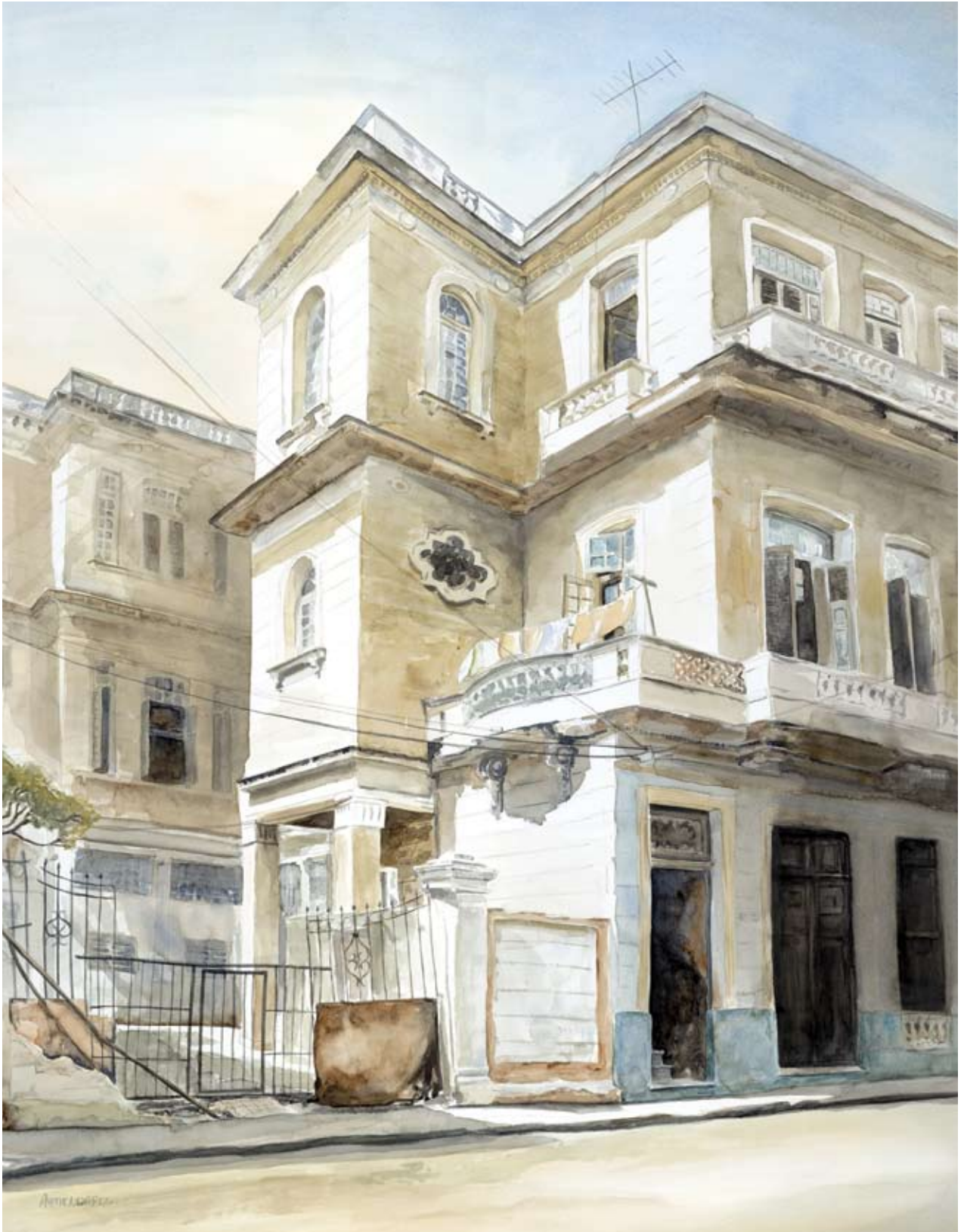
Proof of Life Courtyard (watercolor on paper, 32x23) originally included a person sitting in one of the windows, but Armendariz decided he didn't need this detail to tell the story. All the windows, along with the laundry and antenna, do enough to suggest life.