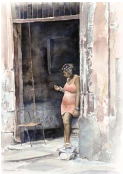
Composed Armendariz sketched the figure in a couple of different positions before settling on a side view for Comfortable in Her Own Skin (watercolor on paper, xxxxx).