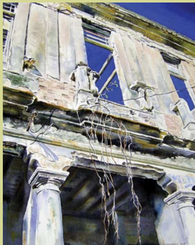
In the latter stage, he layed in the fine details and dark shadows in Sky in the Window (watercolor on paper, ***x**).