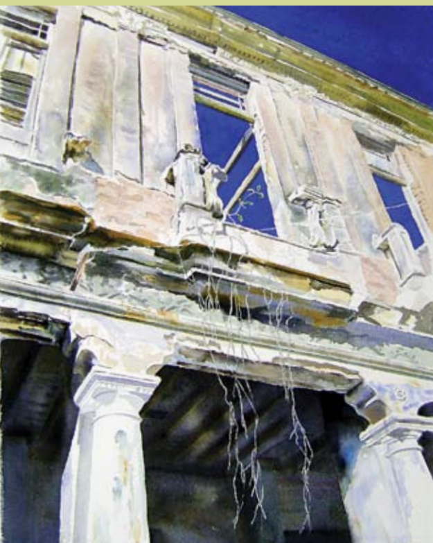
A second wash filled in actual colors and forms and blocked in the entire painting.

Next, he turns off the projector and moves into a three-part painting process. Working primarily with Winsor & Newton watercolors, he blocks on color with a first wash all over the paper and begins to define light and dark areas. He might indicate strong shadows with ultramarine or cobalt blue and go over sunlit areas with cadmium yellow or yellow ochre. These contrasts provide reference points for his eye as he continues to work on the entire piece.