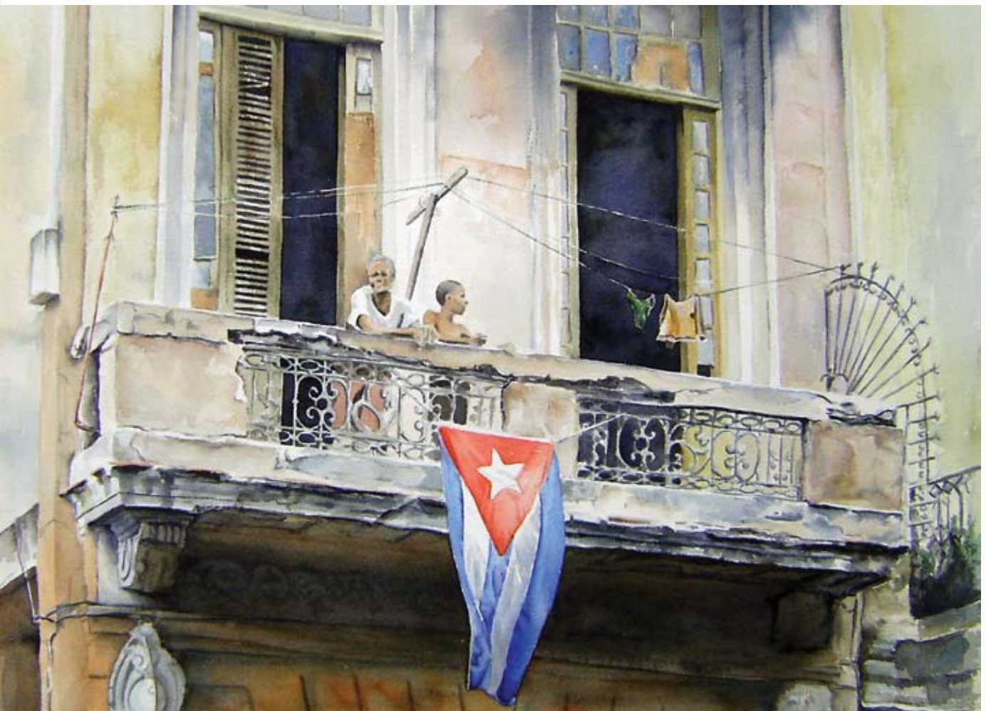
Color Guard The Cuban flag in Flying Their Red, White & Blue (watercolor on paper, 17x23) caught Armendariz's eye, but just after he shot a few quick reference photos, the boy pulled the flag back inside. "I couldn't figure that out," he says. "It was just unusual."

While his Cuba paintings might include a figure sitting on a balcony or standing in a doorway, it's often the building that draws Armendariz to a scene. He made his third and fourth trips to Cuba in 2008 and 2009 and now actively seeks out scenes to paint. "What grabs me is when I'm looking at a building and I see empty spaces, be it a window, a door or an area that leads to another area," he says. "I look at that and go, 'Wow, there's something back there. There's a lot going on that you don't see.'" He believes these hidden